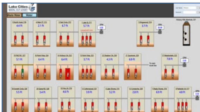
Lake Cities Municipal Utility Authority OnCall Monitoring

Lake Cities Municipal Utility Authority directly realized real-time benefits through their upgraded system with