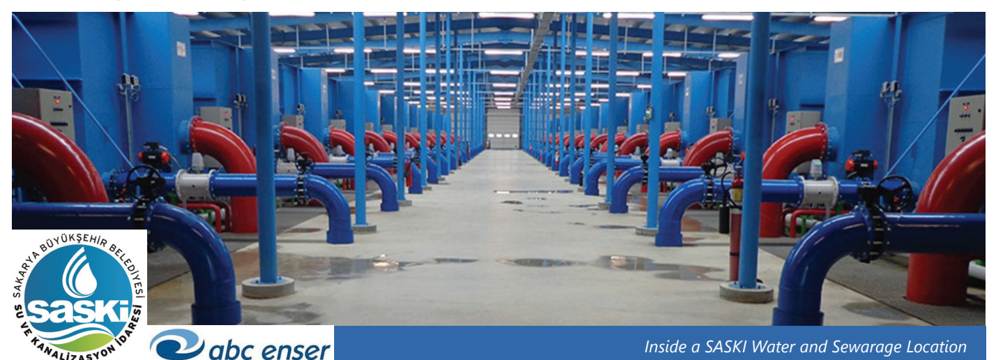
About SASKI (General Directorate of Sakarya Water and Sewerage Administration)

SASKI, the General Directorate of Sakarya Water and Sewerage Administration, (www.sakarya-SASKI.gov.tr), provides clean water to the province of Sakarya, Turkey. Its multiple stations serve approximately 1,030,000 residents over nearly 4,878 square kilometers, handling an annual average volume of over 60 million cubic meters and a maximum capacity of over 129 million cubic meters. SASKI's multiple locations throughout the region include 11 clean water treatment plants, 668 clean water tanks, 380 pump stations, 171 deep well, and over seven and a half million meters of pipeline.