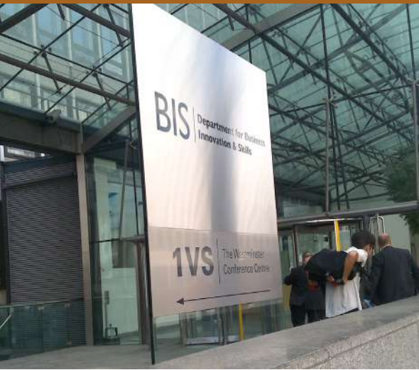
One of the Department's Buildings 1 Victoria Street, London