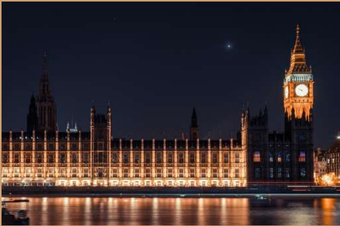
Government Buildings, London

Department for Business Innovation & Skills