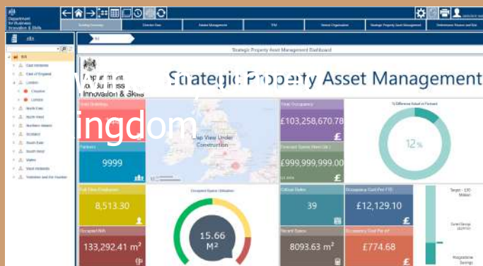
New System: Management Dashboard Screenshot