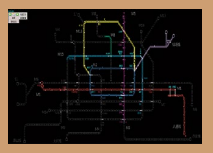
Integrated View of Multiple Rail Lines at the BTCC