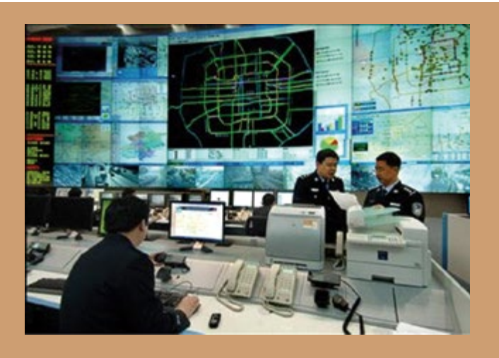
Monitor/Control Room within the Beijing Traffic Control Center

ST Engineering has also deployed GraphWorX32 at various other projects including Singapore Circular Rail and Kaohsiung Rail in Taiwan.