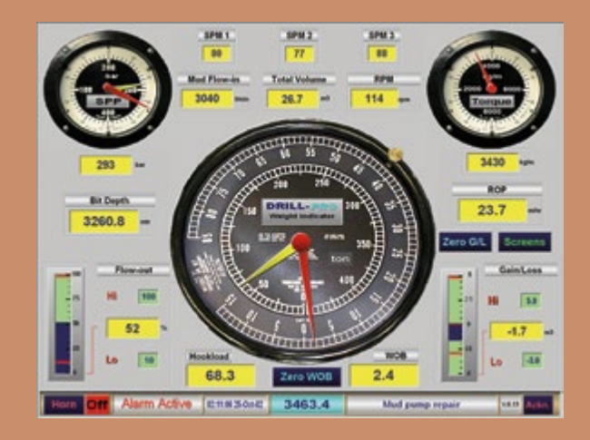
A DRILL-PRO Trip/Well Display by Bohr