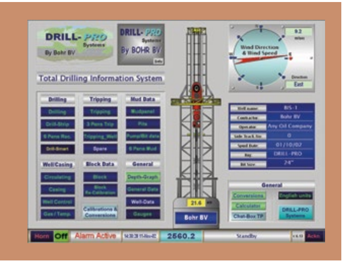
Bohr's DRILL-PRO Systems Menu Display