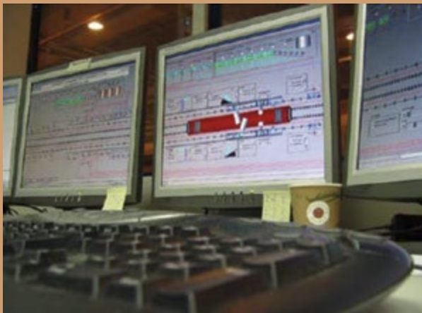
Train Wash Operator Control Area

The GENESIS32 software allows for rich 3D graphics and has the OPC connectivity needed for this very robust and “clean” application.