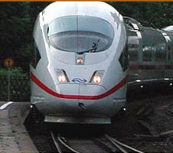
A Deutsche Bahn Train, Clean and Ready to Go