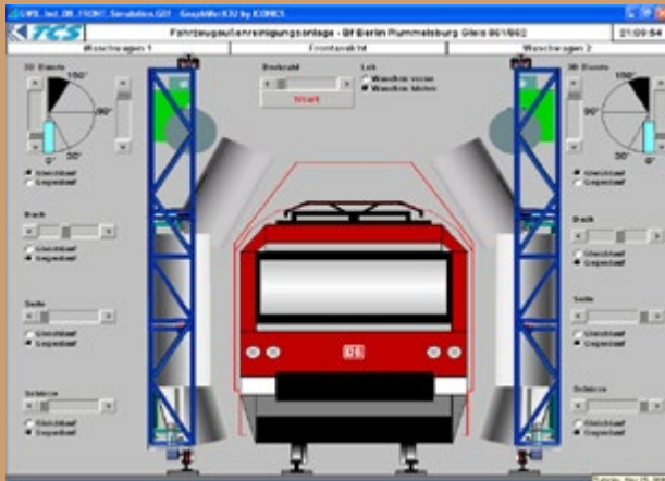
A GENESIS32 Washer Screen