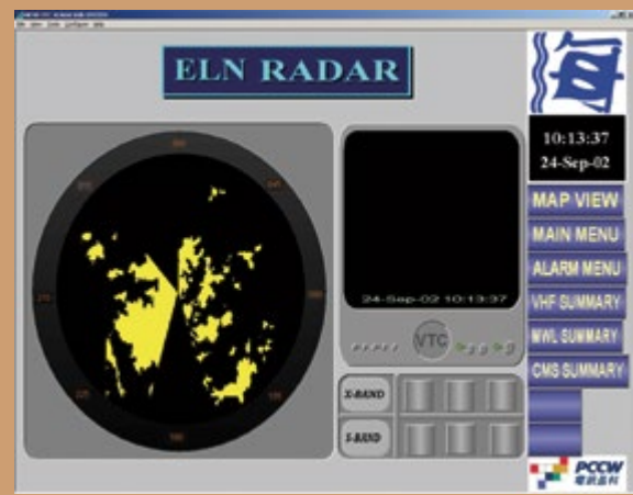
Harbor Radar Control

controls and direct publishing feature of HTML pages over the Internet. The communication towers are built on the various remote islands and locations to collect data about the presence and movement of ships within Hong Kong waters. Communication with these remote sites is critical in terms of keeping the port safe.