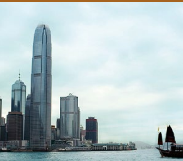
Hong Kong Harbor