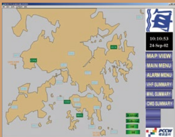
Harbor Overview Map at Hong Kong Marine Dept.