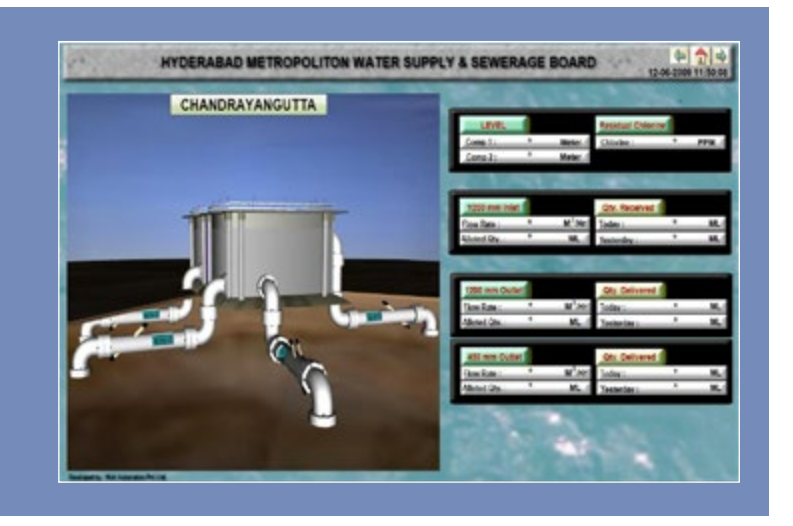
Overview of the Chandrayangutta Tank