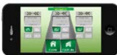
Emergency Escape Lighting