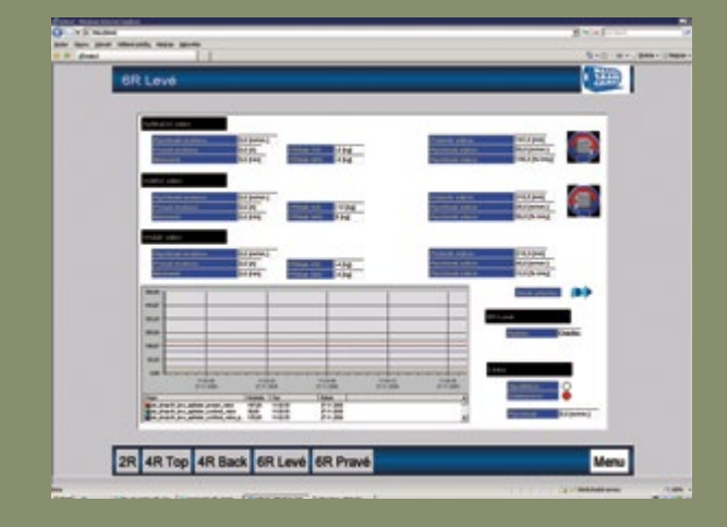
Chemical Treatment View