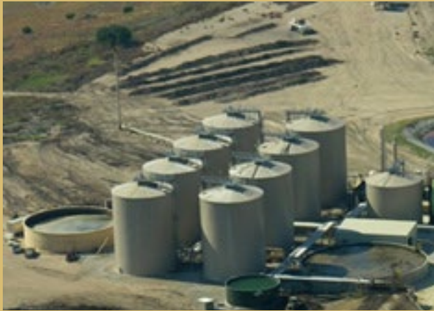
Microgy's Huckabay Ridge Facility in Texas