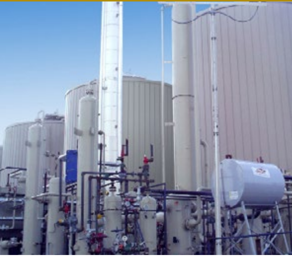
Microgy's Digester Equipment