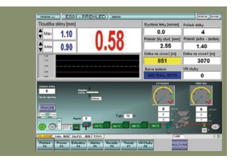
Main Control Screen at PRAKAB a.s.