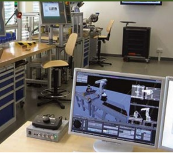
Future Factory Initiative Lab Dresden, Germany