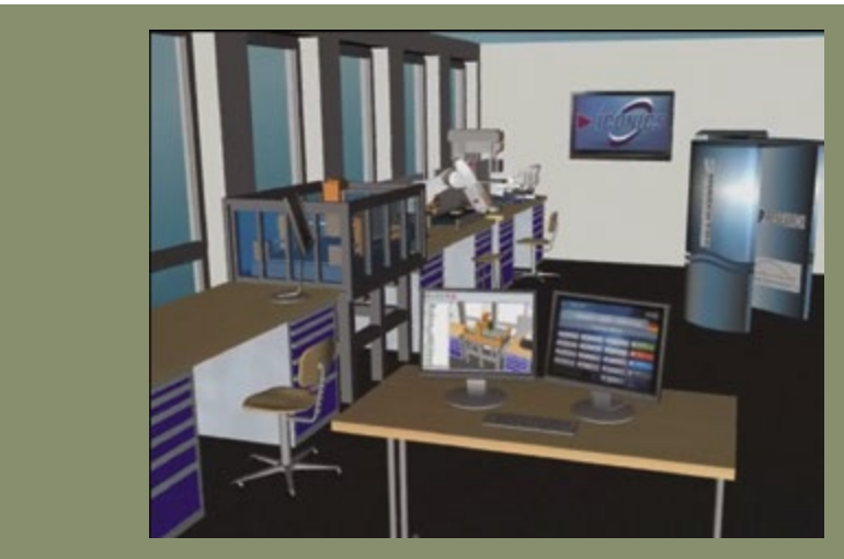
ICONICS 3D Rendering of the Future Factory Lab