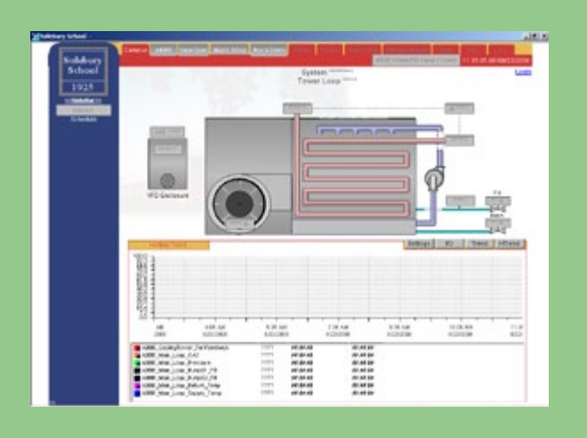
Cooling Tower Monitoring/Control Solebury School

Scheduling is an important requirement for Solebury School. It's directly related to anticipated cost savings and helps meet the school's aim to be a "good environmental citizen". As soon as ScheduleWorX32 was introduced by ICONICS, the school and Vortechs Automation knew it would be a great fit for their project. Solebury School's equation for comfort, convenience, control and cost-savings is proven with Vortechs Automation and ICONICS.