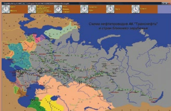
Main Screen Overview of Transneft Russian Pipeline