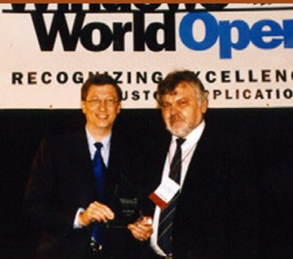
Bill Gates Presenting the Windows World Open Award