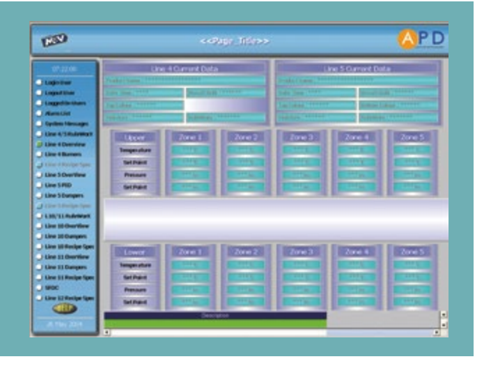
Main Control Screen at UB - McVitie's